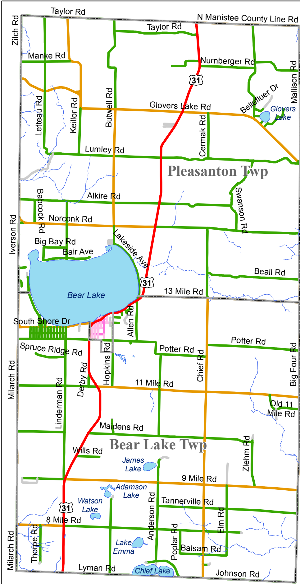
Bear Lake Community Act-51 Road Classifications