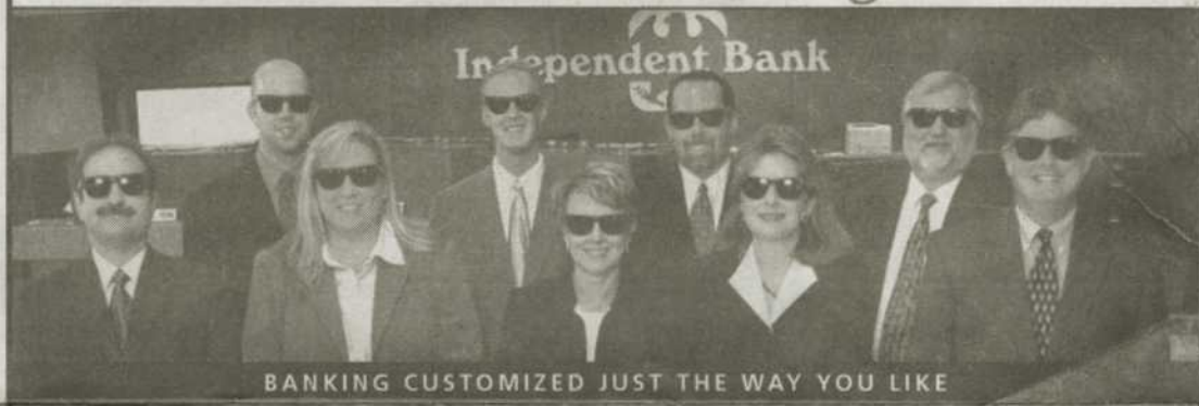
BANKING CUSTOMIZED JUST THE WAY YOU LIKE